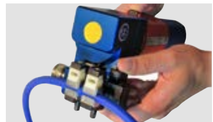
Friction welding machine