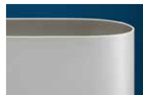
Ammeraal Beltech non-fray belt