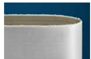
Leading competitor's equivalent belt

*results obtained after identical laboratory tests